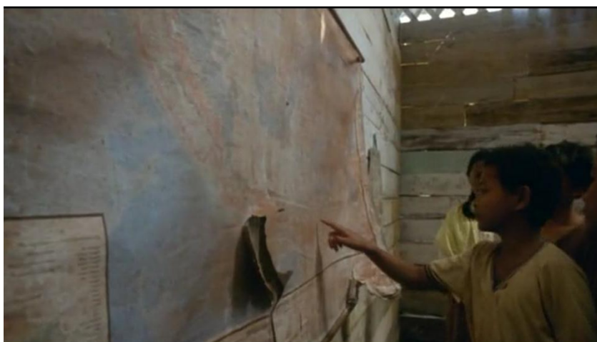
Picture 4.6. Mrs. Mus use Map to guess the students about the region of Indonesia