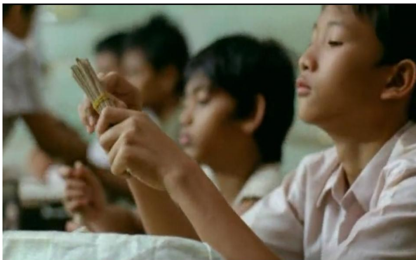
Picture 4.5. The student of Muhammadiyah Gantong use the real thing in the form of twig/root