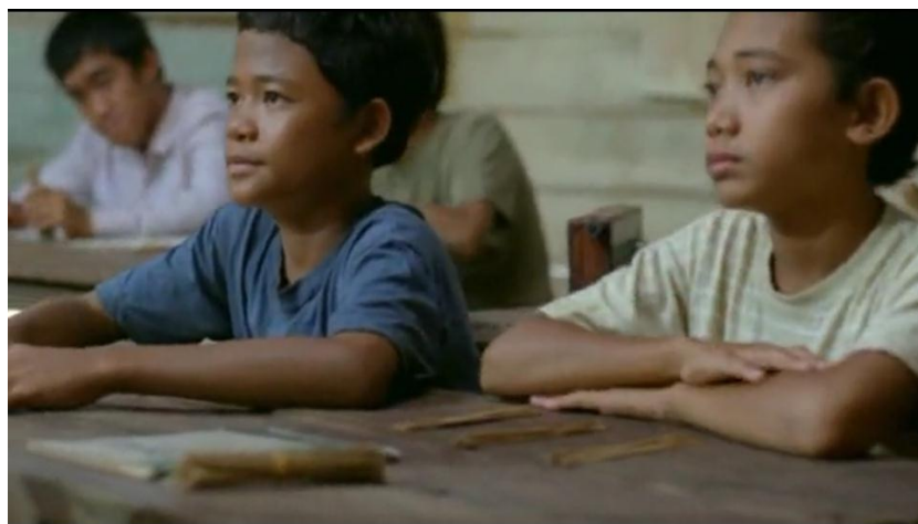
Picture 4.4. The student of Muhammadiyah Gantong seem to focused to learn