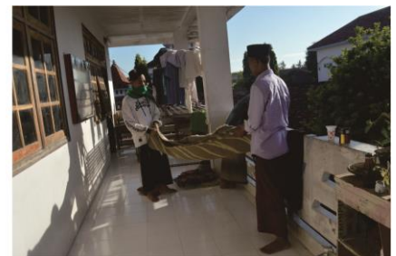
Two members work together