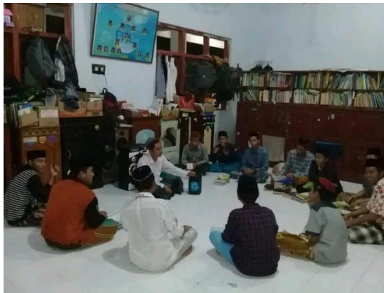
The activity of listening conversation

“When we make the rule to speak English every day in some area, the speaking accent will be like a madures or Indonesian. It’s caused by the habitual accent of their mother language. To solve this, we usually switch on an conversation and music of English to be heard by the members every day, in a hope, it could make their pronounce and accent good as good native” 11