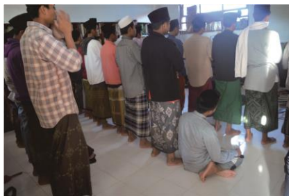
members take group morning prayer

“We members speak English for 70% for every activity a day, because we have free time when we are not in area of English and it’s not talking with EAL’s member. Like in joining other programs of Annuqayah Boarding School; reading classical book, Al-Quraan ect. Even though we have an obligation to be English man, we are still santries of Annuqayah.” 6