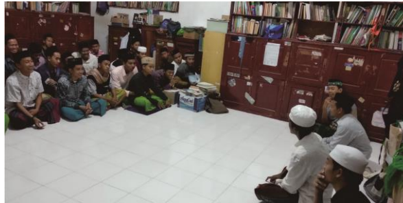
Sharing and giving the program by tutors after discussion of tutors.

are flexible on all condition what members need on their development. The things that become our consideration in making decision of what we are doing in class are the members' needs on their speaking development, the members' mentality on speaking English, the vocabulary building, all aspects they need in daily communication when talking outside the class, the members' situation on their speaking ability, focusing on the daily language target, setting the spontaneous reflection not the memorization, and many more. These aspects are used in building the members' capability on their daily language capacity when having social relationship with other members outside the class as they are obligated to speak English every day.” 4