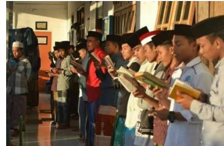
members' punishment while

EAL has designed the local are by special program which designed conditionally depending of the members need , means that the administrators have a special time to discuss what the members need while evaluate all the program done. There are two types of the program; work program semester (weekly, monthly, half year) and a program which is applied in conditional situation, like a punishment, subject setting, ect. All members would be monitoring from how they communicate with others, for the member are obligated to use English and the value of the subject the do. The important support which is caused the success of this program is coming from the old members who also keep the fresh members activity; practicing, memorizing, and getting advice, in order the good achievement will be true.