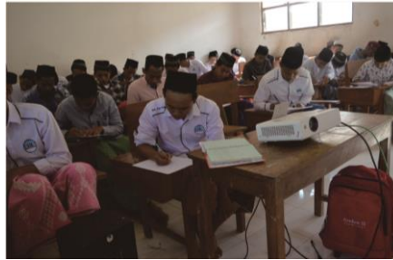
Quarantine program memorizing

“Before we are staying in EAL, we must pass a hard selection that is held by EAL as the quarantine program. The will be 30 participants in that program that will be given speaking subject for beginner. The participant must join this program for a month for making them ready when facing the rules of EAL. After we pass from quarantine program, we need to study hard and memorize many vocabularies. In order, we are ready to directly speak with all members by English every day” 8