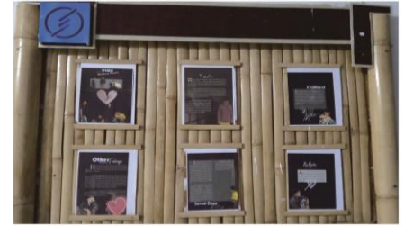
The wall magazine of Speaking class

EAL also has a publication activity, which is aimed to make the members of EAL be competent in the world of literature. The media of this are magazine and wall magazine. The magazine is published every semester, while the wall magazines which belong to each class save TOEFL preparation class are weekly magazine. It means the members publish it every week. 1