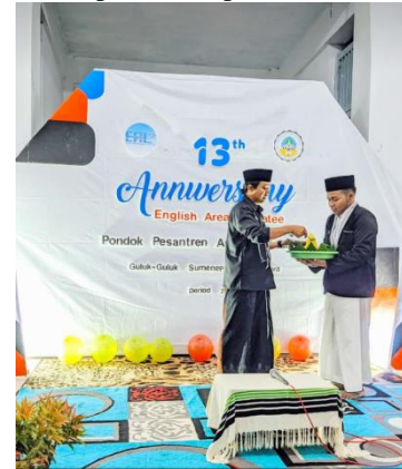
Anniversary of EAL