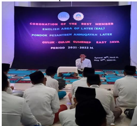
Coronation of the best member