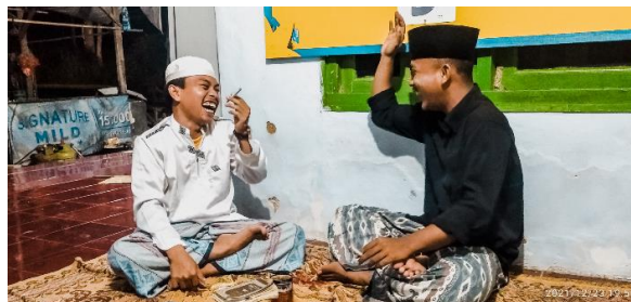
Two members talk happily by English

The researcher also draws a common thread on the data obtained, that the program implemented at EAL is included in Communicative Practice , or Information Gram Activity category according to communicative approach planning activity at chapter II, where the members use English in real life or real information is exchanged, and where the language used is not totally predictable. For example, students might have to draw a map of their neighborhood and answer questions about the location of different places, such as the nearest bus stop, the nearest café, etc.