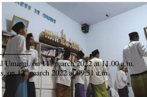
The activity of EAL's members while using

“Actually, this daily activity is not only an obligation for speaking class, but also for all classes in this location, English Area of Latee. In this method, we really want to make all the members adapt to always speak English in order that the soul of English will become our habits in daily life. This daily activity has been becoming an obligation for all members everyday. To make the members allow this role, the tutors make a punishment for the members who didn't obey this role which is held once a week, every Thursday night. By this method, we hope we can create good output.” 5