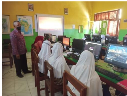
Processing of listening viral song

Yes, indeed, during the vocabulary learning process activities in Class VIII, students listen to songs to increase their vocabulary so that they are not bored in participating in the vocabulary learning activities. Vocabulary teaching plays an important role in learning English by listening to the songs, students can listen to the songs that are played. Listening is considered a difficult skill to master because it is considered a skill that requires the ability to understand spoken language. I consider that listening is a language skill that must be mastered well by each student in order to improve understanding of new vocabulary. 4