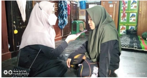
- Result of observation picture