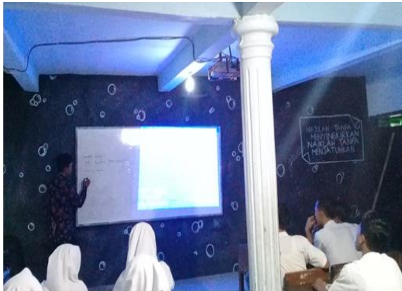
The teacher explained the material about writing