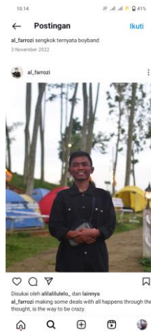
Figure 4.4: Instagram account user @muaddibunnas

In the upload above, it can be seen that the student with the Instagram account @muaddibunnas uses images accompanied by argumentative text, because the text conveys arguments about the thought process and efforts to achieve results.