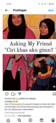
Figure 4.2: Instagram account user @n.urtales

From the results of direct interviews with MDW, the resulting findings state that the account users feel that the Instagram platform is very good for writing skills. Because Instagram has many features for us to learn to write, the use of captions on Instagram is open only to English Department Students but all study programs can also use them. English captions depend on individual beliefs. MDW also said he was motivated by the Instagram platform, because he also studied on that platform but for using captions in English, MDW stated that he experienced changes and improvements when making captions because when he composed his own words he felt that his vocabulary had improved a lot.