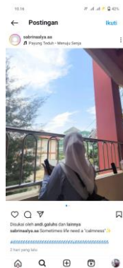
Figure 4.6: Instagram account user @sabrinaalya.aa

In the upload above, it can be seen that the student with the Instagram account @sabrinaalya.aa uses images accompanied by descriptive text, because the text describes the author's situation.