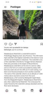
Figure 4.1: Instagram account user @mr.syamsul_arifin

From the results of a direct interview with SA, the resulting findings state that users of the account feel that the Instagram platform can improve their writing skills through English captions. For English Department Students, using captions in English provides a very positive value. SA also said that she prefers to use captions in English because According to him, it is cooler and can express ideas better and can also provide motivation to his followers or readers. SA feels that using the Instagram platform can improve his writing skills through these captions and can also motivate him to continue learning.