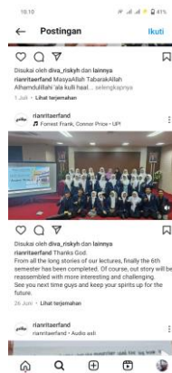
Figure 4.7: Instagram account user @rianritaerfandi

In the upload above, it can be seen that the student with the Instagram account @rianritaerfandi uses images accompanied by recount text, because the text recounts experiences or events that have already occurred.