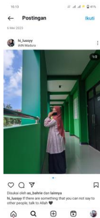
Figure 4.5: Instagram account user @zulfakamaliaakhmad

In the upload above, it can be seen that the student with the Instagram account @zulfakamaliaakhmad uses images accompanied by hortatory exposition text, because the text encourages the reader to encourage or persuade the reader to do or believe something.