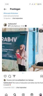
Figure 4.8: Instagram account user @fadilatunhnf

In the upload above, it can be seen that the student with the Instagram account @fadilatunhnf uses images accompanied by argumentative text, because the text expresses views or opinions about education which are initially difficult, but the results are useful.